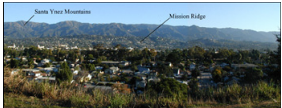
Pictured above: The Mission Ridge anticline, which is formed on the hanging wall block of the Mission Ridge segment. The fold forms a prominent landform on the coastal piedmont. The Santa Ynez Mountain Range can be seen in the background.

point, a sea cliff and beach platform are notched into the land. The land, along with the sea cliff and beach platform, is eventually uplifted as the result of earthquakes and a new beach is formed at sea level.