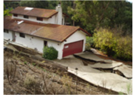
Sycamore Canyon home damage.