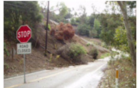
Sycamore Canyon road closure.